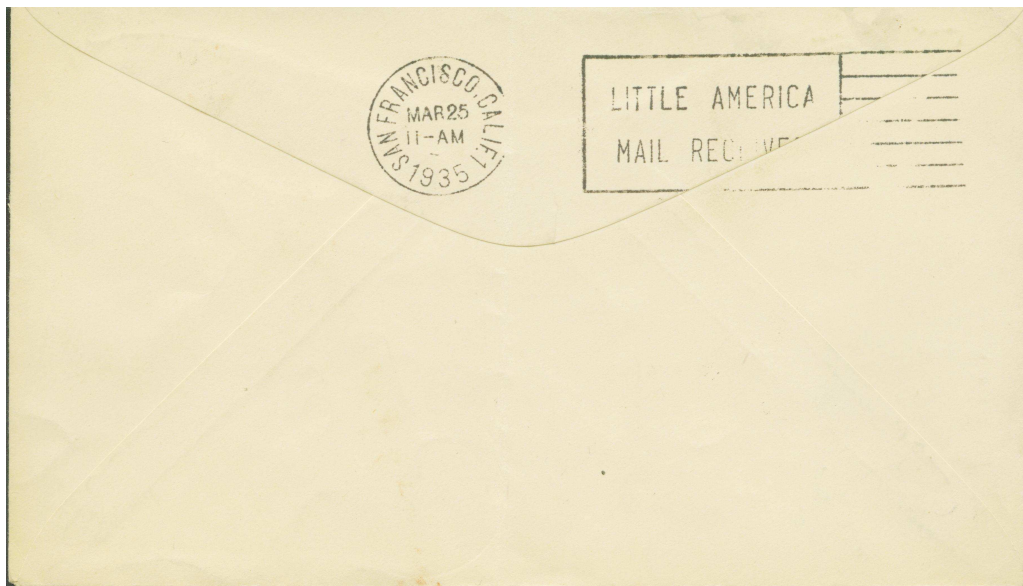
Figure 3. Byrd Delayed Mail Cover Reverse

I looked more closely at the postmark which was dated 8:30 PM on January 31, 1934 at Little America, Antarctica. I then turned the cover over (see Figure 3, Byrd Delayed Mail Cover Reverse) and found a receiving mark stating “LITTLE AMERICA MAIL RECEIVED” at 11 AM on March 25, 1935 at San Francisco, California. The evidence was clear, the letter had been delayed in mailing for over one year. Combined with the seemingly exotic destination, this was a very interesting and special cover. Only when I became an adult and was able to further research the cover using more than a Scott catalog did I find out that my cover was one of 56,000 (two-thirds of the total received) that were delayed in transit during the second Byrd expedition.