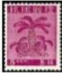
Figure 2. Stamp from the first Ryukyu Islands issue under U.S. administration.

were provisional stamps issued, during the period from July 1945 through 1948, by postmasters of Kume Island (see Figure 4) and four island districts of the Ryukyu Islands. The Kume Island stamps were created locally and those issued by the four island districts were created by placing handstamps on Japanese stamps. Some of the provisional issues are quite expensive, especially in used condition and should be certified.