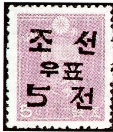
Figure 1. Japanese-issued stamp overprinted for use in South Korea under U.S. military administration.

After World II, South Korea was under U.S. military rule until August of 1948 when the Republic of Korea was established and began issuing its own stamps. Stamps were first issued for South Korea, while under U.S. military administration, in February of 1946. The first six stamps were created by overprinting stamps previously issued by Japan. Figure 1 shows the low value in the set of stamps issued on February 1, 1946.