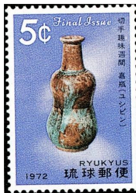
Figure 3. Final Ryukyu Islands issue under U.S. administration.