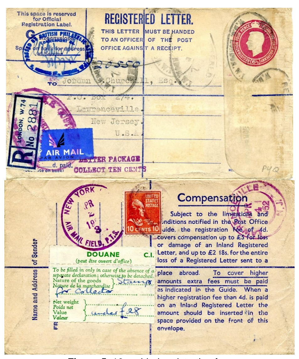
Figure 5. 10¢ added registration fee.

international rates, including those for airmail, postage due, return receipt service, parcel post, registration service, and special delivery service. The cover whose front and back are shown in Figure 5 uses a 10¢ Prexie to pay the added registration fee required for a registered airmail letter package mailed from London, England to Lawrenceville, New Jersey and valued (in England) over 2 Pounds 18 Shillings but under 28 Pounds. The Figure 6 cover uses two 10¢ Prexies plus six 3¢ Prexies and a 2¢ For Defense issue to pay the 40¢ international airmail rate to Rio De Janeiro, Brazil. This cover also has red stamp from the Board of Economic Warfare stating that the technical information contained inside is approved for export.