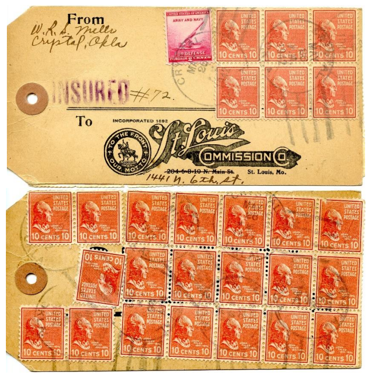
Figure 13. Fourth-class mailing tag with 26 of 10¢.

The parcel tag shown front and back in Figure 13, which is dated May 26, 1942, has 26 copies of the 10^{\circ} Prexie along with a single 2^{\circ} "ARMY AND NAVY" defense issue for a total of $2.62 in postage. Since a fourth class parcel mailed from Crystal, Oklahoma to St. Louis, Missouri would be subject to zone 4 rates, a likely rate breakdown is 35^{\circ} for insurance up to $200, 10^{\circ} for the first pound, and $2.17 for 62 additional pounds ( 3.5^{\circ} x 62).