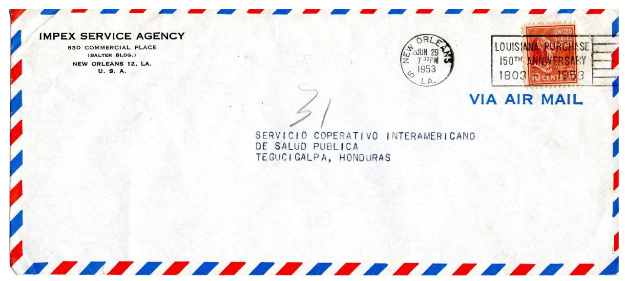
Figure 3. 10¢ solo on air mail to Honduras.