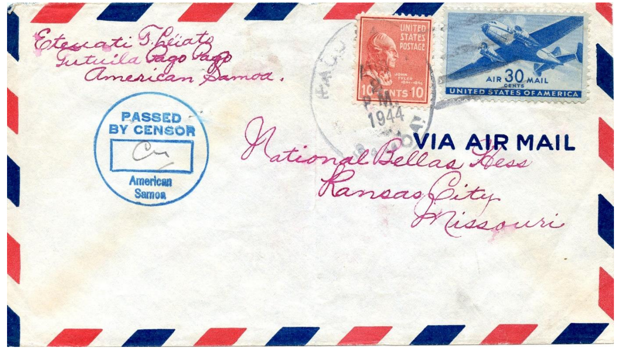
Figure 7. Censored air mail from American Samoa