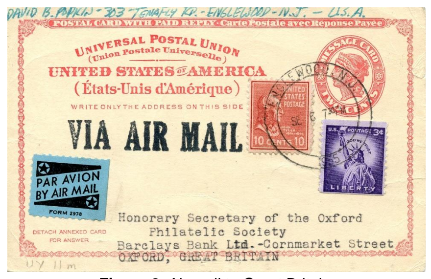
Figure 9. Air mail to Great Britain.