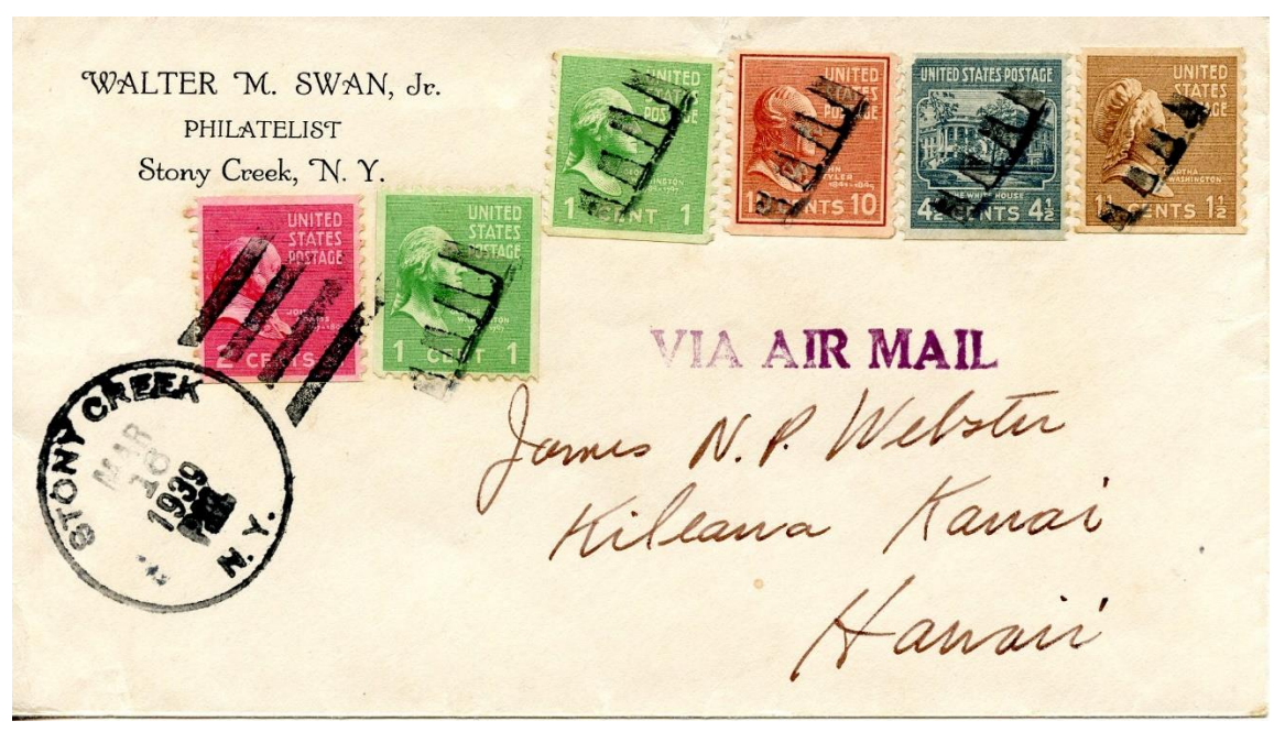
Figure 15. Air mail to Hawaii with 10¢ coil.