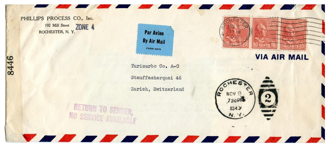
Figure 8. 10¢ Prexies paying FAM rate to Europe.

Final examples of the 10¢ Prexie used for international mailings are pictured in Figures 8 and 9. In Figure 8, three 10¢ Prexies pay the 30¢ rate for an up to one-half ounce letter using the Foreign Airmail Service (FAM) from New York to Zurich, Switzerland. The letter, which was mailed on November 3, 1943, was returned to the sender, Phillips Process Co., Inc., because FAM service had been suspended due to World War II. This rate applied until November 1, 1946 when it was superseded by a 15¢ airmail rate to Europe. An example of the 15¢ rate is shown in Figure 9 where a 2¢ message card is supplemented with a 10¢ Prexie and 2¢ Liberty issue coil. The card was mailed from Englewood, New Jersey to the Oxford Philatelic Society in Oxford, England. The Reply card is no longer attached so was evidently used to reply to the sender.