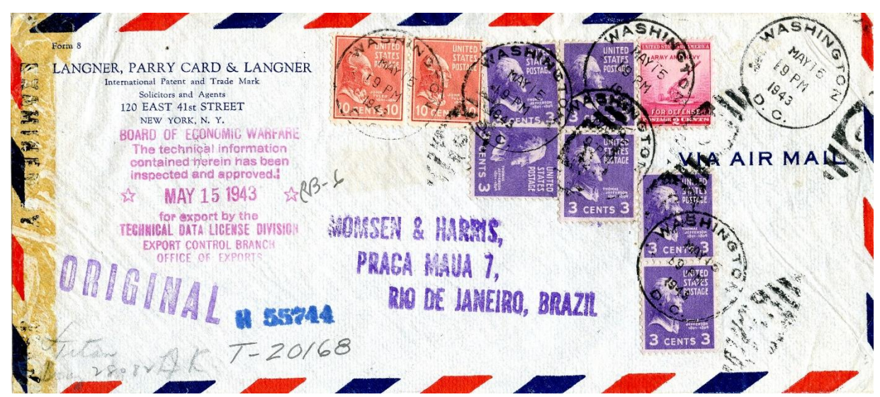
Figure 6. Air mail to Brazil.

2011) 40¢/one-half ounce rate required for airmail service from American Samoa to Kansas City, Missouri. The cover, mailed on August 2, 1944, contains a marking indicating it was passed by the civil censor (since there is no APO address and sending location is identified) at American Samoa. American Samoa is an unincorporated U.S. territory and during wartime, censorship of civilian mail was necessary to prevent the intentional or inadvertent disclosure of information about such things as military movements, fortifications, and military force concentrations.