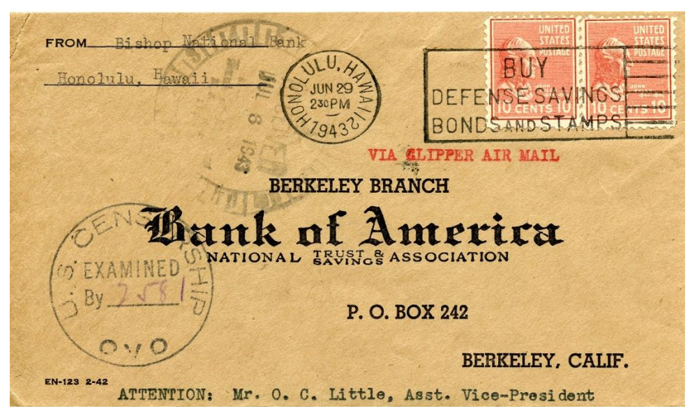
Figure 12. Air mail from Hawaii.

The parcel tag shown front and back in Figure 13, which is dated May 26, 1942, has 26 copies of the 10^{\circ} Prexie along with a single 2^{\circ} "ARMY AND NAVY" defense issue for a total of $2.62 in postage. Since a fourth class parcel mailed from Crystal, Oklahoma to St. Louis, Missouri would be subject to zone 4 rates, a likely rate breakdown is 35^{\circ} for insurance up to $200, 10^{\circ} for the first pound, and $2.17 for 62 additional pounds ( 3.5^{\circ} x 62).