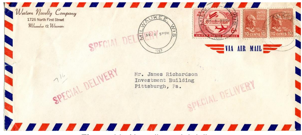
Figure 11. Air mail special deliver.

The airmail cover shown in Figure 11 is franked with the 6¢ airmail stamp honoring 50 years of powered flight paying the domestic first class airmail rate and two 10¢ Prexies paying the 20¢ special delivery fee. The cover was mailed on November 5, 1953 from the Western Novelty Company in Milwaukee, Wisconsin to Pittsburgh, Pennsylvania. A second airmail cover bearing two 10¢ Prexies and a censor marking is pictured in Figure 12. In this instance, the letter which was mailed from Honolulu, Hawaii to the Bank of America in Berkeley, California on June 29, 1943, pays the 20¢ FAM 14 airmail rate for up to one-half ounce. That rate was in effect between Hawaii and the continental U.S. from April 21, 1937 thru January 14, 1945.