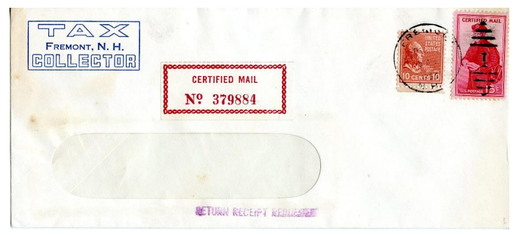
Figure 10. Certified first-class mail with return receipt.

On domestic mail, the 10¢ Prexie was often used either by itself or in combination with other stamps to pay for postage and various fees. The Figure 10 cover mailed from the Freemont, New Hampshire "Tax Collector" in December 1956 uses the 10¢ Prexie to pay the 3¢ first class surface rate and 7¢ return receipt fee in addition to the certified mail fee which was paid by the 15¢ certified mail stamp.